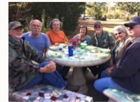
Relaxing with friends on a Mystic Springs workday