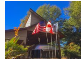
Camphost's flags on a beautiful Spring day

Temporary Airstream storage is $1.00 (in storage area) per day, $2 per day on a camp site (no hookups) with board approval of site. Neither the Park, the Unit nor it's Board of Directors or members are responsible for RVs in storage. Mystic Springs Cove, Inc. is not affiliated with the manufacturer of Airstream recreational vehicles, or the Wally Byam Caravan Club International (WBCCI).