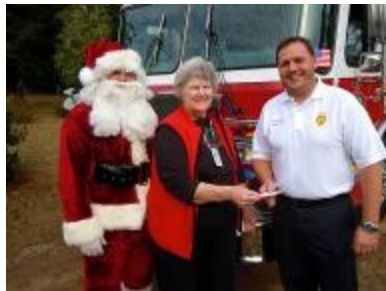
Annual donation to the McDavid Fire Department