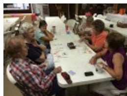
A great way to end the day, playing games and looking at a beautiful sunset.