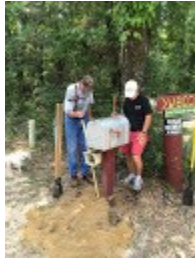
Moving the mailbox out to the road by the entrance to the park.