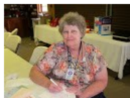
Your President wishes you farewell.