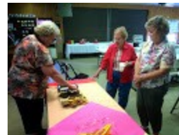
Cookies & Ice Cream