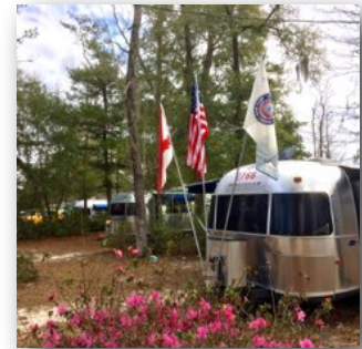
More silver...with flags and flowers!