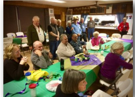
The crowd watches as contestants do Pres. Cheryl's "golf" game.

11:30 Pot Luck lunch (each Airstream brings a dish to share)