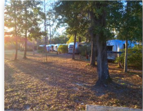
Silver Airstreams under the setting sun at Mystic Springs!