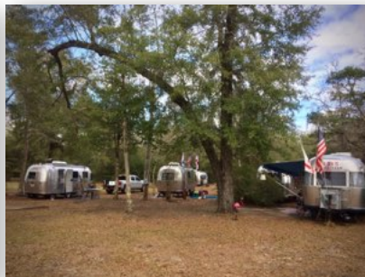
A good looking group of trailers from Alabama at Mystic Springs!