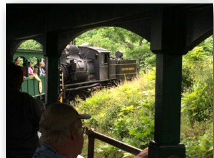
A 1926 Cass, WV Scenic Railroad steam engine pushes train cars up a logging road.