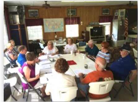
Members of the Mystic Springs Park and Unit conduct business at the July rally.

Don't forget this is a Buddy Rally so bring your friends. Also, if you have a freezer, bring it and the makings for our annual ice cream treat. This "End of the Road Rally" will be my last official rally as your president. I would love to have as many as possible come for the fellowship. Thank you for your part in making our Unit successful!