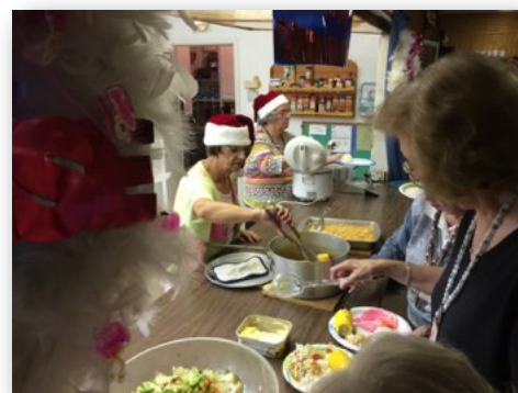
A wonderful "Christmas" meal is served.