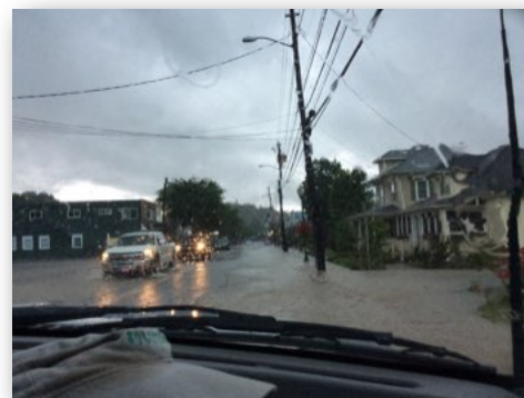
Flooding begins in White Sulphur Springs, WV as we leave a tour at the National Rainbow Trout Hatchery.