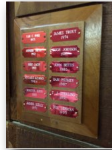
Updated deceased president's names