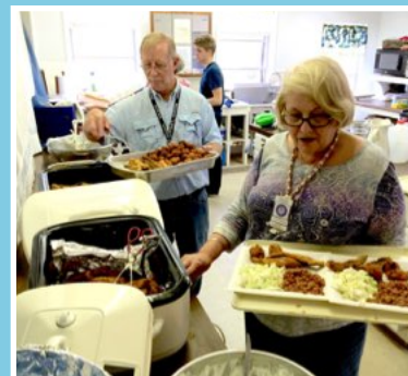
(top) Front gate azaleas are in bloom.