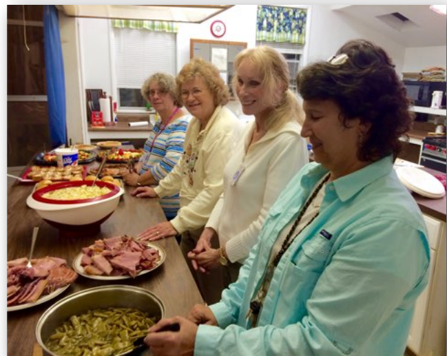
Two sumptuous meals are served!

MAKE NEW FRIENDS AND KEEP THE OLD ONE IS SILVER AND THE OTHER IS GOLD