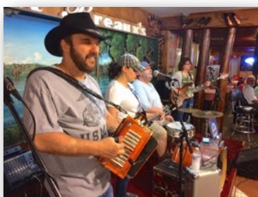
L - Cajun music at a restaurant in Breaux Bridge, LA.