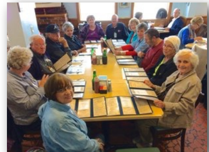
Unit 29 dinner at O'Steen's in St. Augustine.