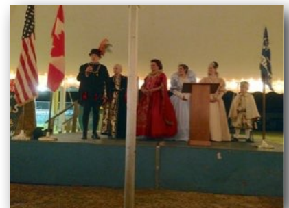
Spanish Royal family descendants in St. Augustine.

Men-trim driveways and sites shrubbery, change three faucets, put deck back under mower-new belts, change air filter, work on completing site sign project, plant flowers. Bring tools.